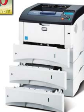
Product depicted includes optional extras.