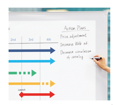
Projector Screen Board that is writable

While using a projector, you can write and erase simultaneously**