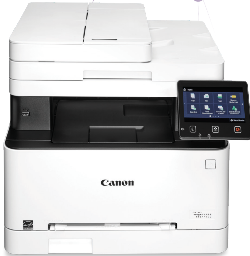
Color imageCLASS MF644Cdw Item Code: 3102C005