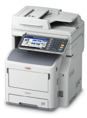
MPS5502mb+ Up to 55 ppm<sup>1</sup>; 630-sheet standard paper capacity, upgradable to 3,160 sheets; 20-sheet convenience stapler

Intuitive 9" touch-screen display: simplifies navigation, enhances user productivity, enables access to web-based applications