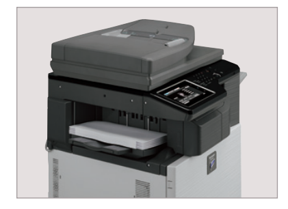
Available compact inner finisher with 50-sheet staple capacity.