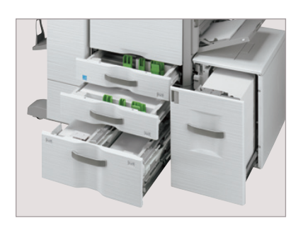
Up to 6,600-sheet paper capacity with available options.