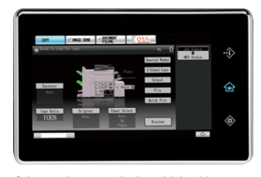
Color touch-screen display with intuitive menu navigation.