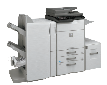
MX-M564N shown with options.