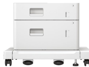
HIGH CAPACITY CASSETTE FEEDING UNIT-D1