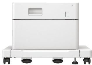
CASSETTE FEEDING UNIT-AR1