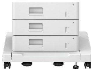
CASSETTE FEEDING UNIT-AX1