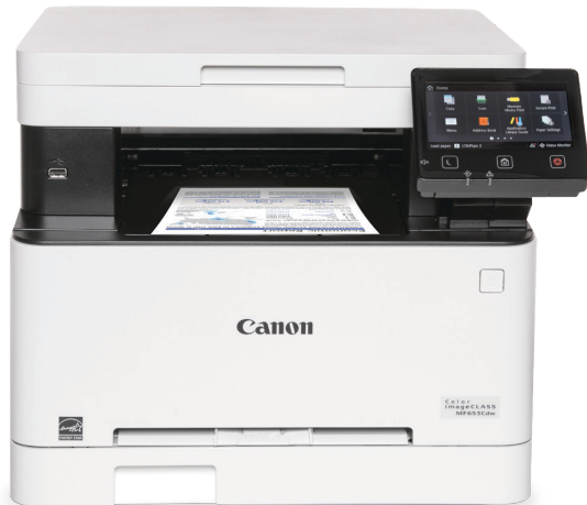
Color imageCLASS MF653Cdw