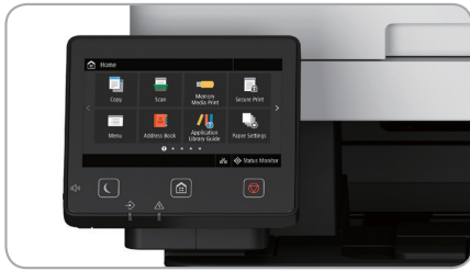
* Printer Screen May Vary.