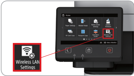
* Printer Screen May Vary.