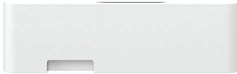
OPTIONAL CASSETTE AF-1 Item: 0732A032