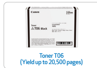
Toner T06 (Yield up to 20,500 pages)

Use of Canon GENUINE toner cartridges helps provide longer equipment life, high yields, reliable performance, high-quality output, and minimal jamming or issues.